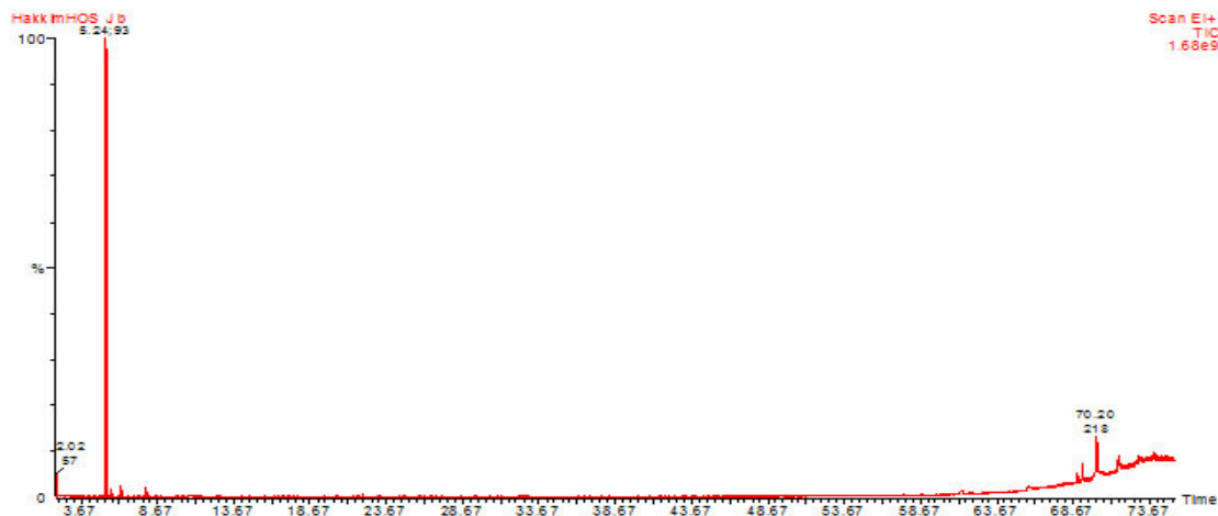
Figure 2. GC Chromatogram of heavy oil